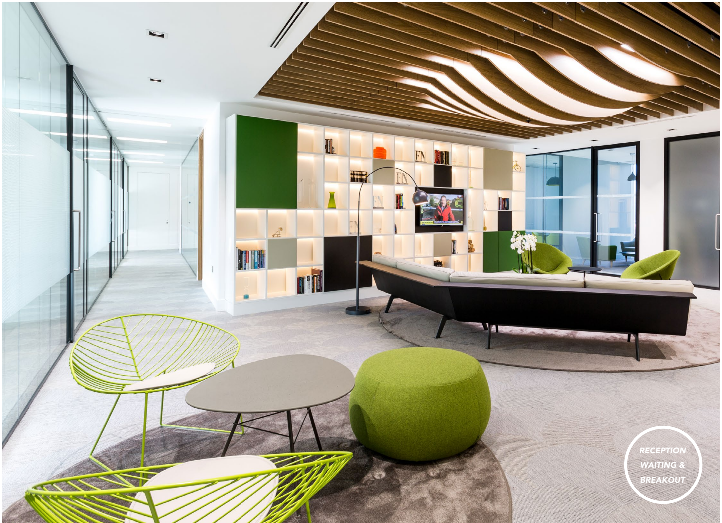
RECEPTION WAITING & BREAKOUT