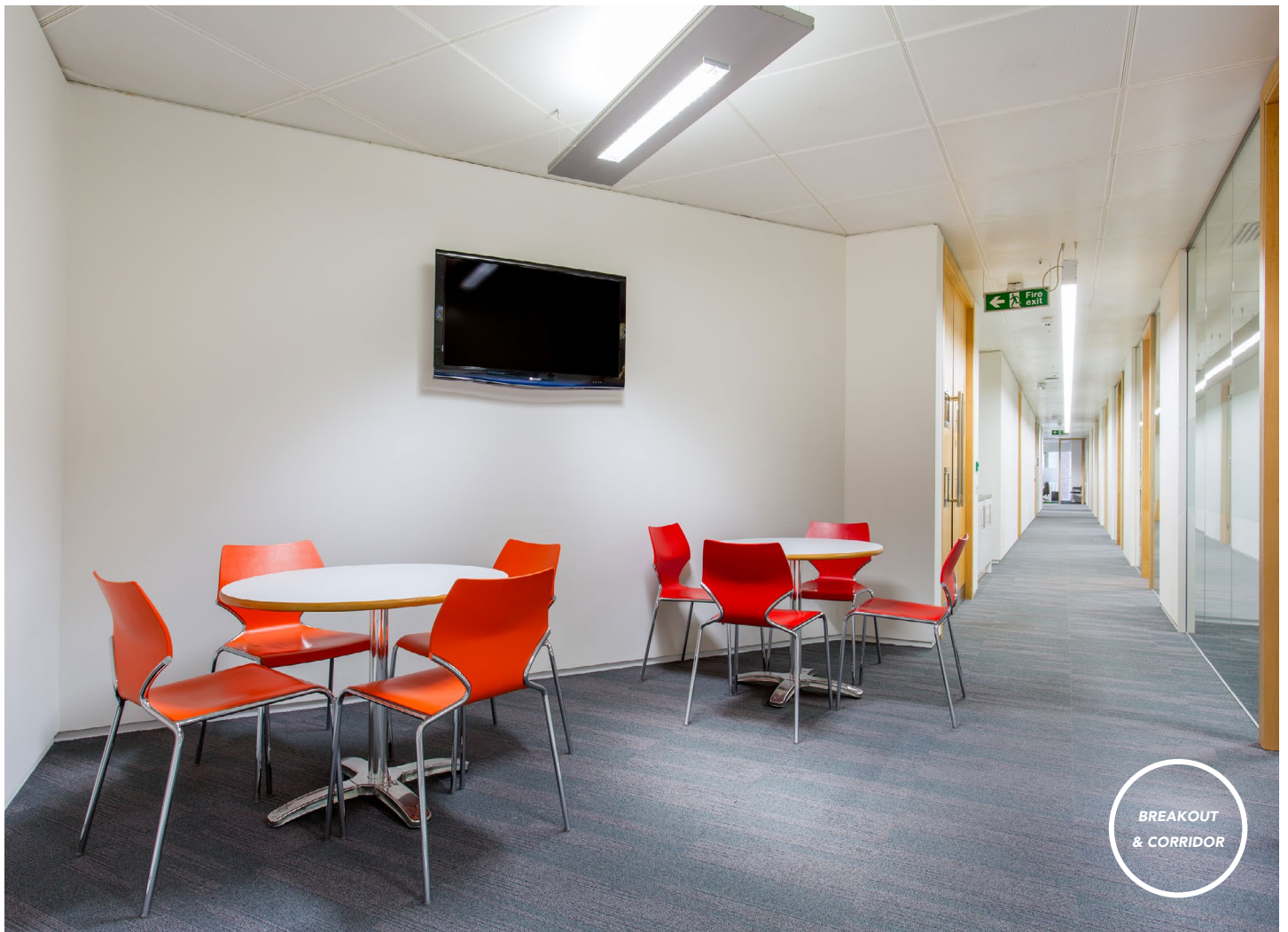
BREAKOUT & CORRIDOR

"From the moment that we first met Beale & Company we knew that they would be a great team to work with. The project was able to realise significant financial benefits from a close coordination of the pre-existing fit-out, aligned with a clear design vision from our design studio."